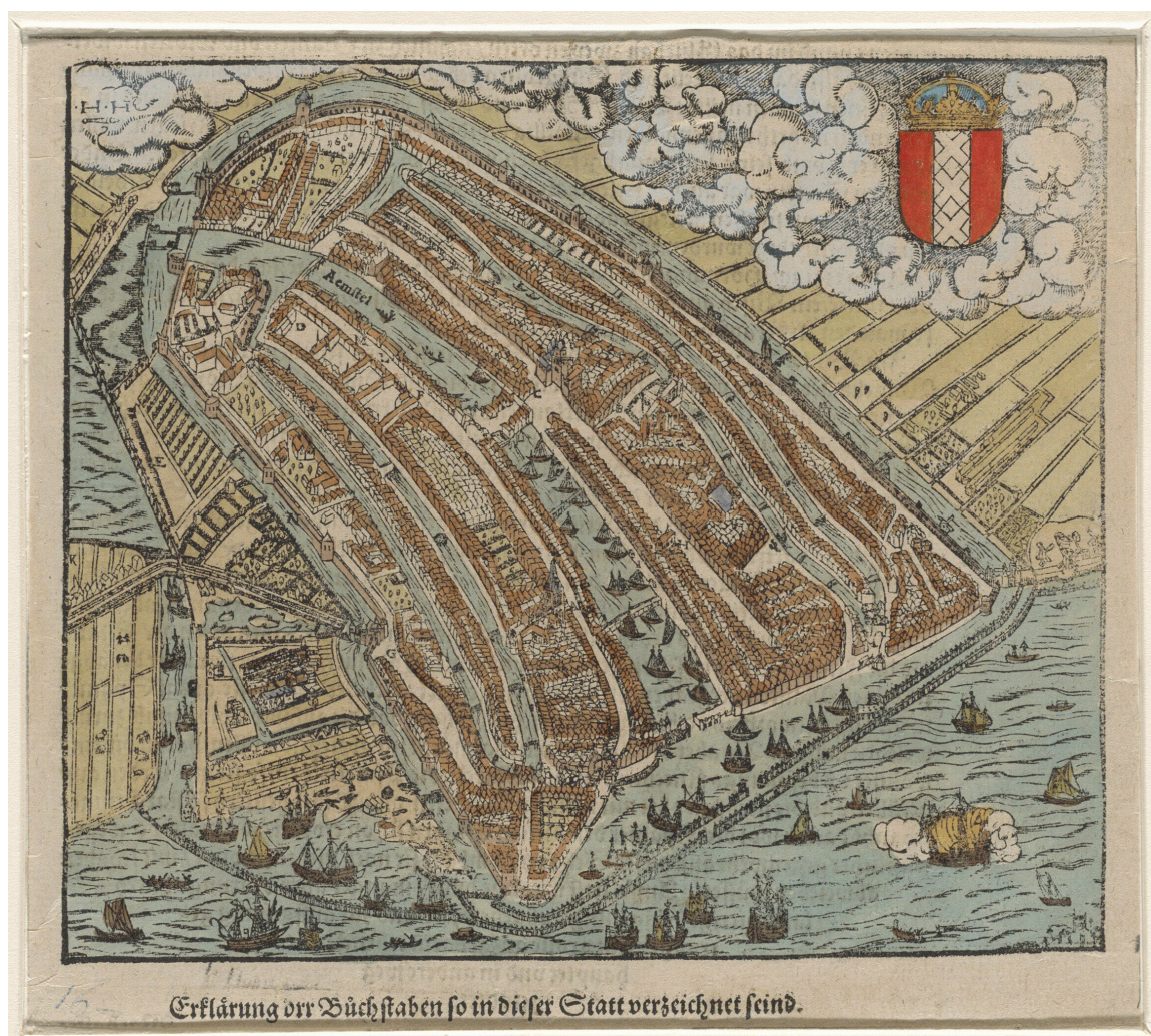
^ Fig. 2 Historical drawing of Nieuwmarkt showing a water passage underneath the Sint Antoniespoort.

limited by a variety of factors: access to data to start with. The re-use of data related to a specific site requires access to historical archive material that is organized according to institutions that produced the data. This means that the data is consultable in a way that is not always logical to contemporary minds. To consult archival material, you need to know which institute is responsible for the material. In many ways, this is a challenge. The physical environ-