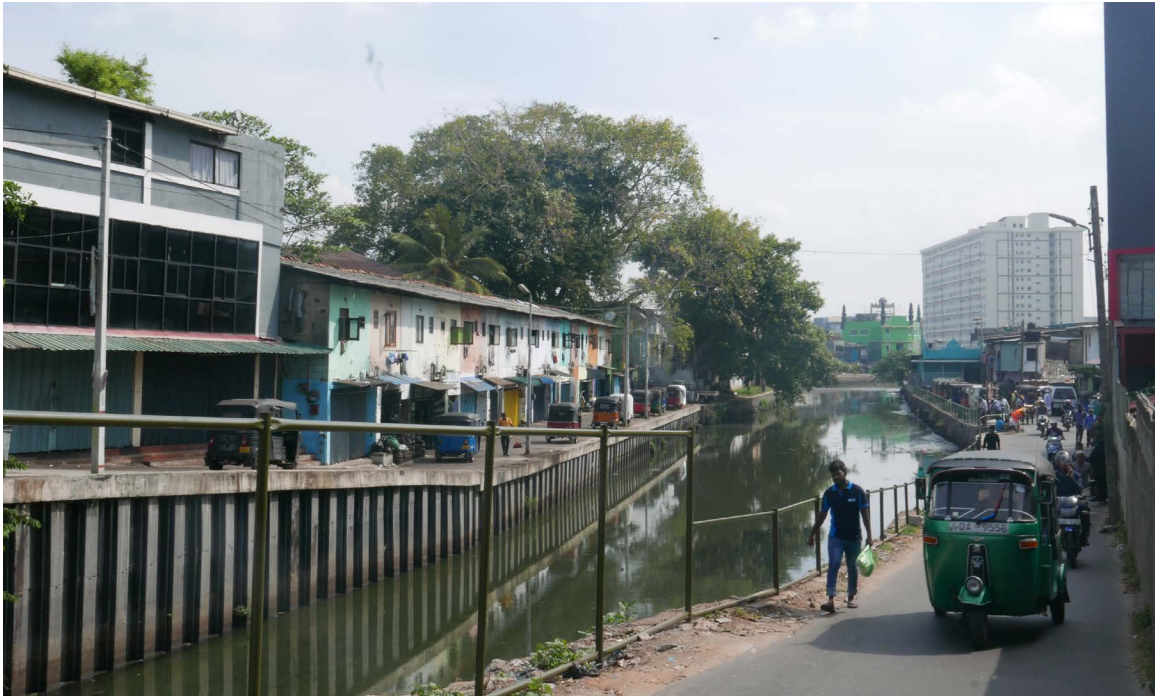
^ Fig. 4 The neglected Saint Sebastian Canal that is lost in the modern urban context of Colombo (Source: Queenie Lin, 2019).