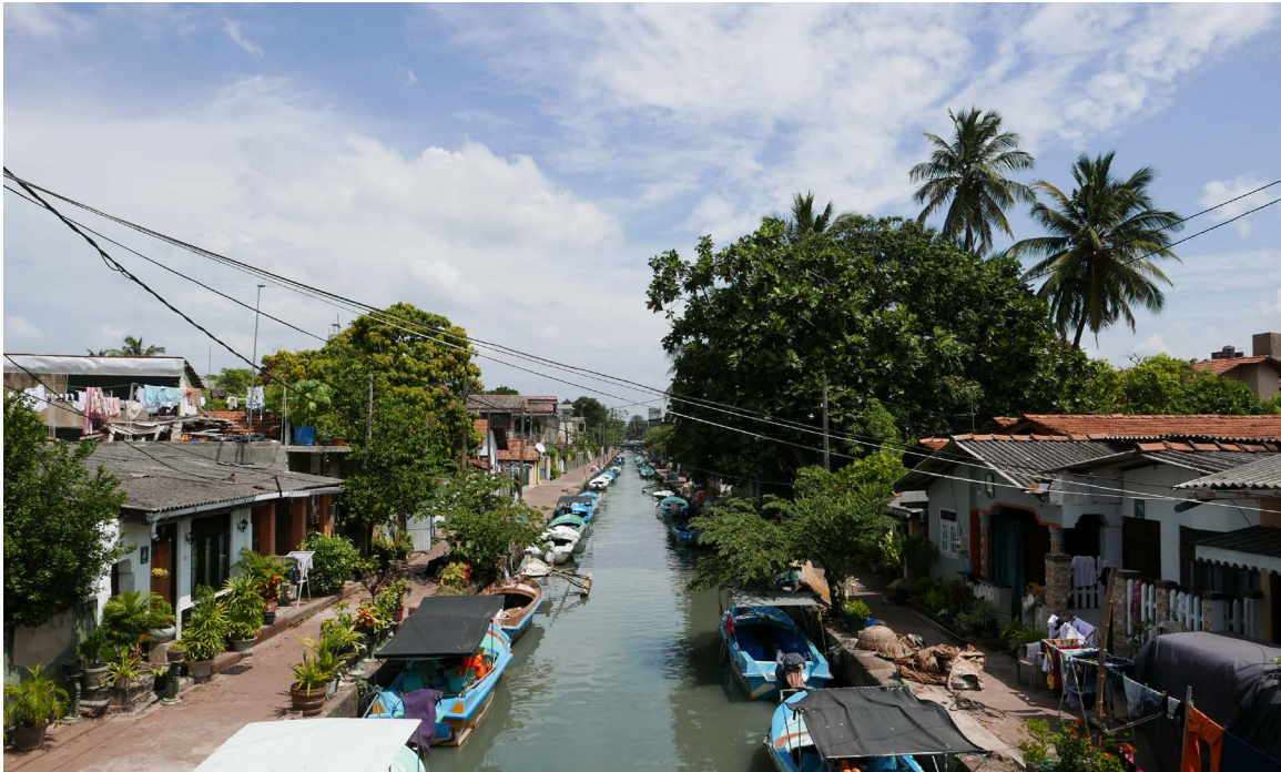
^ Fig. 3 The bustling leisure spot and tourist attraction of Hamilton Canal in Negombo (Source: Queenie Lin, 2019).