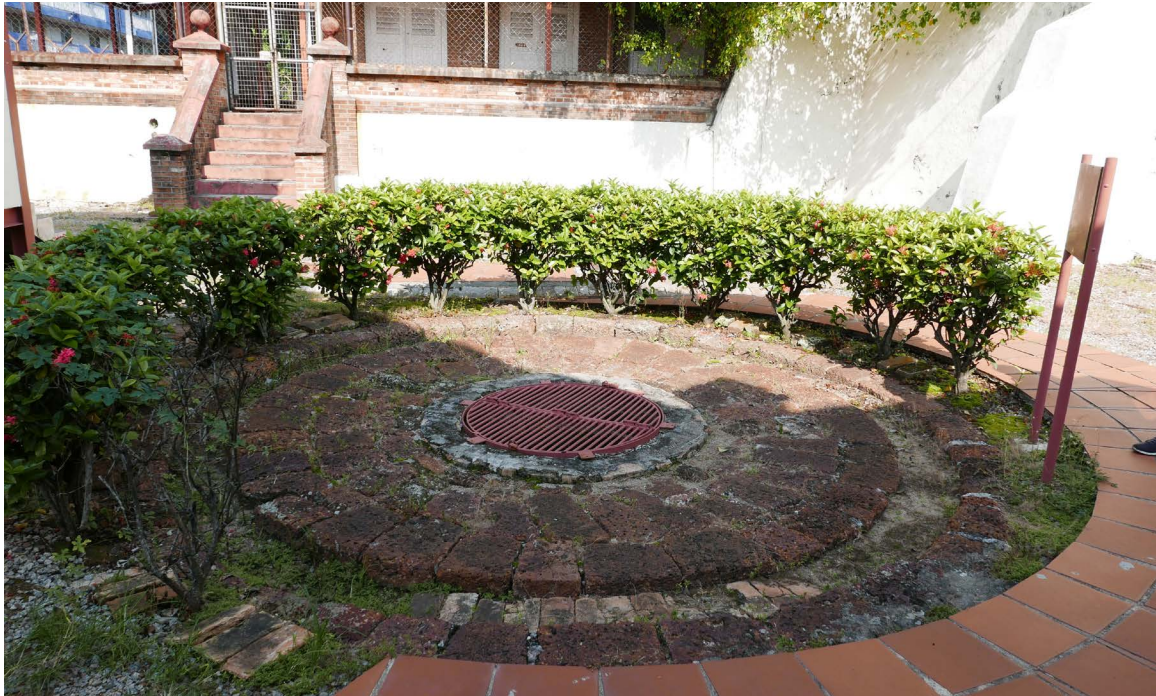
^ Fig. 2 One of the remaining well structures from the Dutch era in Malacca at the Stadthuys complex shows a mixed use of Portuguese laterite stone for drainage and the Dutch addition of brickworks for defense.

the water” (Bremner and Blagden 1927). This type of detailed legislation concerning water infrastructures is seen throughout VOC archival resources but rarely seen in the archives pertaining to other colonial powers.