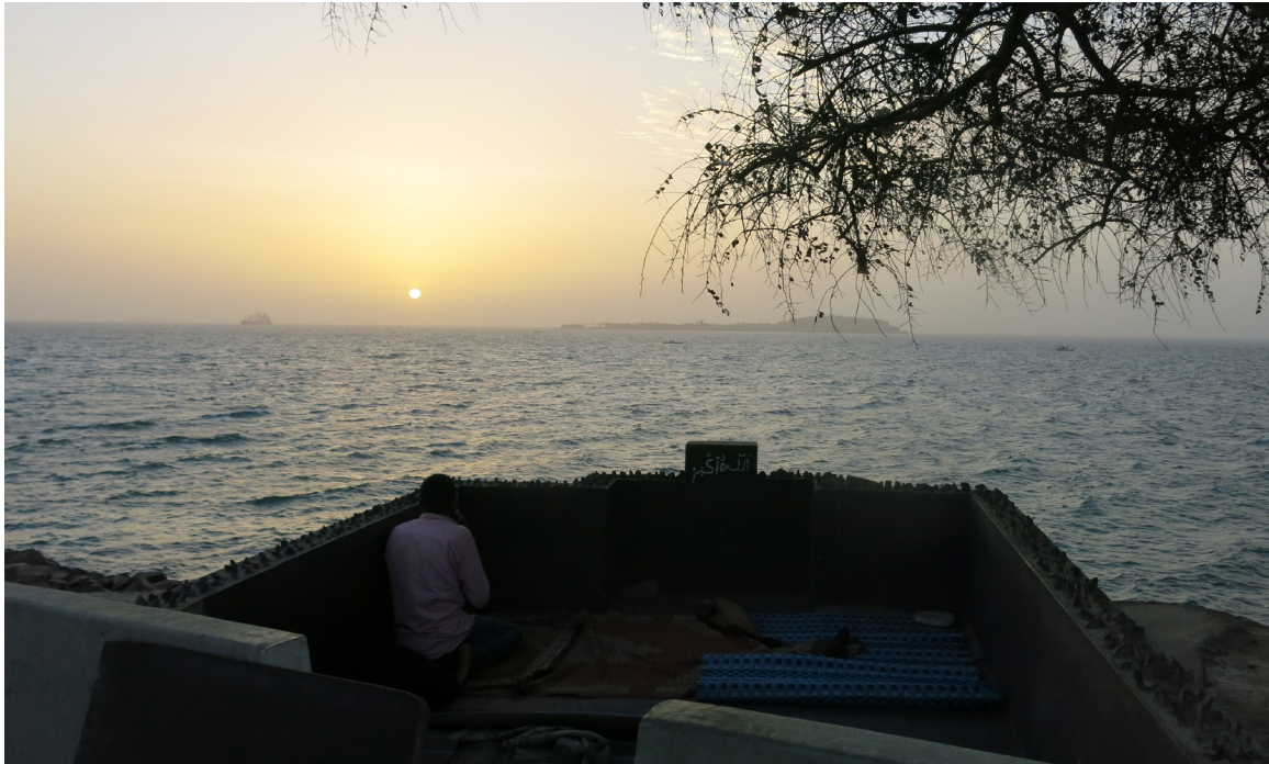
^ Fig. 4 Dakar, Senegal. Early morning prayer turned toward Mecca and in front of the sea and Gorée island (Source: Pascal Bourdeaux, 2018).

Humans now recognize that if modern science and technology know how to act on natural laws to exploit their potential in the collective interest, the latter very often perceives nature only superficially. In the replacement of the state of nature, which is relegated essentially to mystical contemplation and sensitive life, but also in the replacement of nature religions disqualified as archaisms, it is productivist systems and consumerist lifestyles that have been sacralized. However, these systems also show their limits here in societies that care little about environmental ethics or a holistic acceptance of nature. The loss of religions' influence on modern societies has not only weakened the political, social and cultural functions of religious practice; it has also affected what is often the forgotten relationship of humans to the sacred-