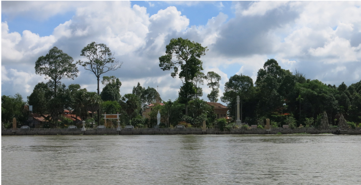
^ Fig. 2 Phước Hậu Pagoda, Trà Ôn, Vietnam. An example of a religious site located at the crossroads of different rivers and canals in the Mekong Delta.

tions of monuments) prove that people organized their activities according to the rhythm of the river, its layout, its relationship with the maritime coast and the network of hills and places of surrounding elevation. Even today, the ancient establishment and presence of religious communities along the rivers, still marked by archaic places of worship, ancestral and modern places of collective prayers (and meeting places), tell us how people have maintained this relationship with their river, in both rural and urban areas.