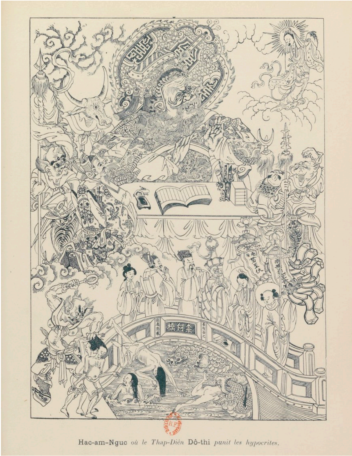
^ Fig. 3 The fourth level of Hell (the river of mud) in the Sino-Vietnamese tradition (Source: Riator Léon and Léofanti, 1895).