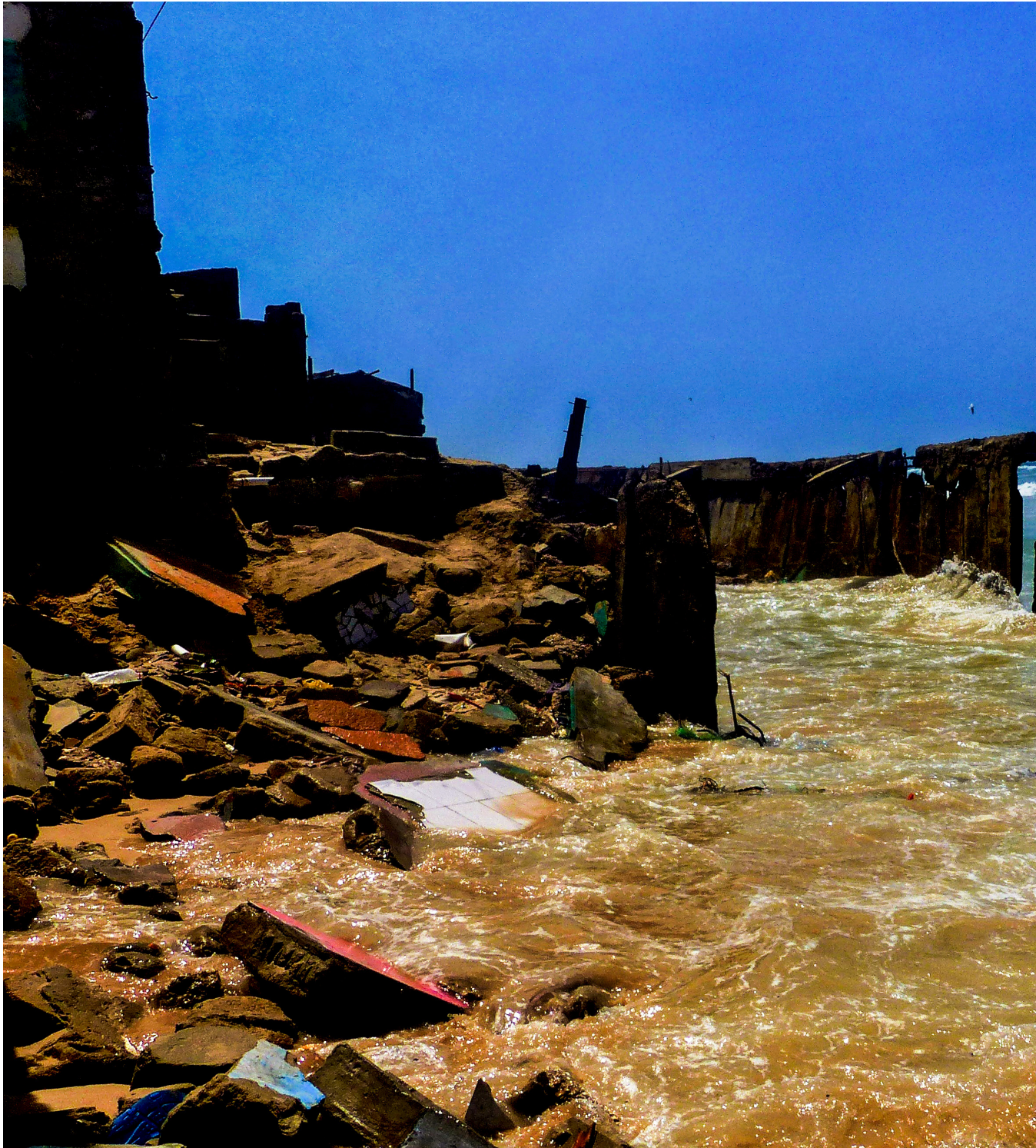
^ Fig. 3 Houses destroyed by erosion along the coast of the Island of Saint-Louis (Source: Abdoulaye Toure, 2021).