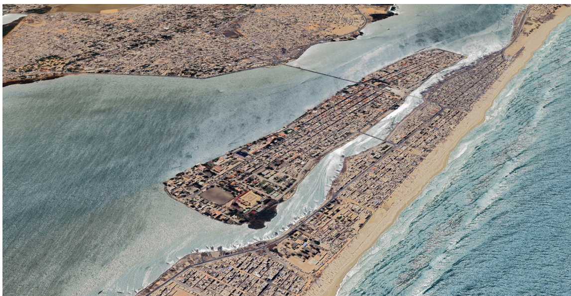
^ Fig. 2 Aerial view of Saint-Louis Island showing the Languede Barbarie and its vulnerability to the threat of sea-level rise (Source: Google Earth, 2023).

has ceased to be an element of cosmology in which the elements of nature take on a sacred character because they are essential to life; it has simply become a commodity.