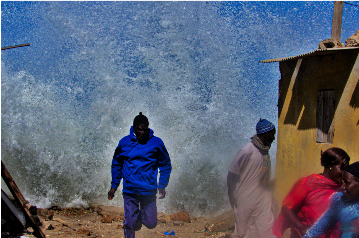
^ Fig. 4 Inland advancement of the sea, threatening everyday human life.