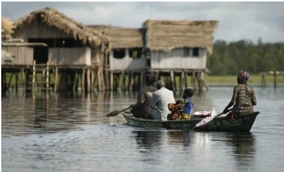
^ Fig. 2 Nzulezo community on water.