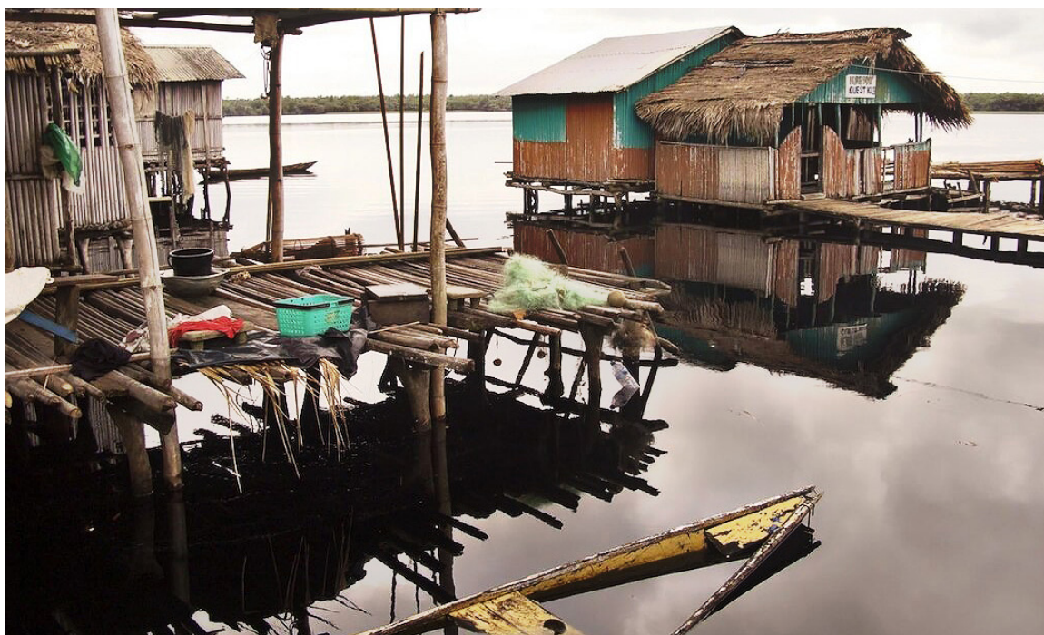
^ Fig. 3 High water level.