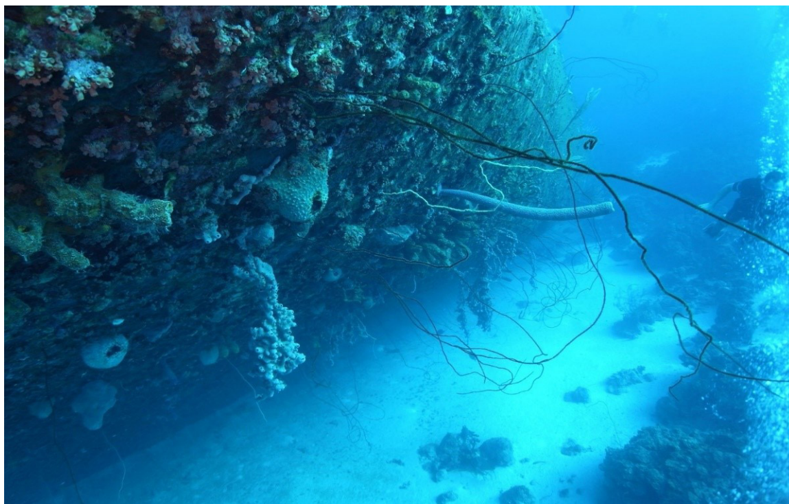
^ Fig. 2 Interlink between natural and cultural heritage underwater (Source: Pixabay, 2017).

rine biodiversity sustainably (Iwabuchi 2022). An eco-friendly form of fishing gear, the weirs are completely submerged during high tide, and emerge into full view at low tide, allowing people to collect fish while sustaining many species of marine life. In addition, catches from tidal weirs play a significant role in community health, as freshly caught fish and other seafood are higher in nutrients than imported, processed food. Indigenous coastal communities, based on their accumulated knowledge of local ecosystems, have adapted the weirs to particular coastal topographies and seascapes. In fact, the Intergovernmental Oceanographic Commission of UNESCO has endorsed a project entitled Indigenous People, Traditional Ecological Knowledge, and Climate Change: The Iconic Underwater Cultural Heritage of Stone Tidal Weirs as an action project as part of the United Nations Dec-