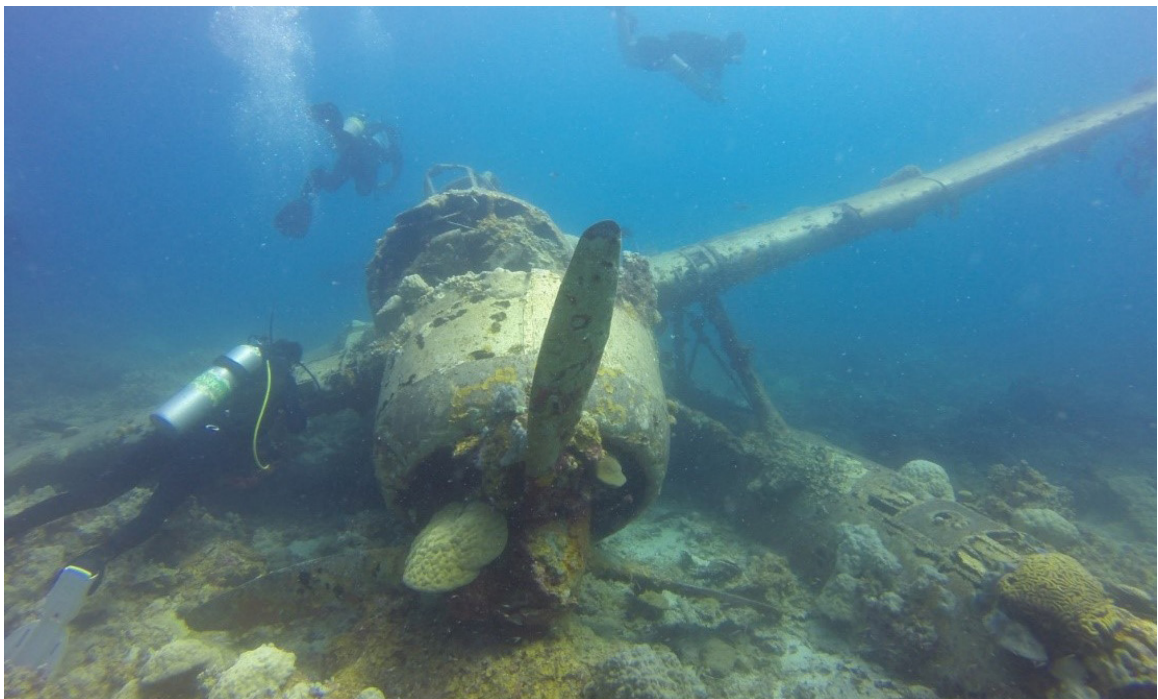
^ Fig. 4 Metal corrosion in underwater cultural heritage (Source: Pixabay, 2016).