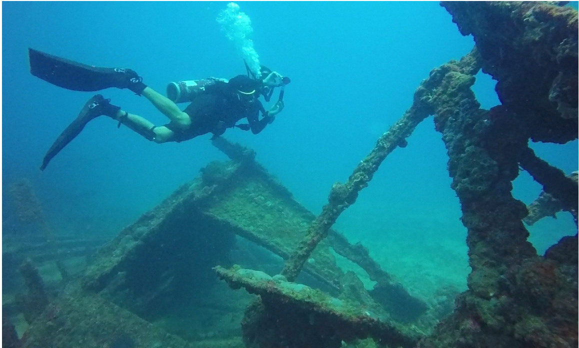
^ Fig. 3 Underwater cultural heritage as part of tourism and the diving industry (Source: Pixabay, 2016).