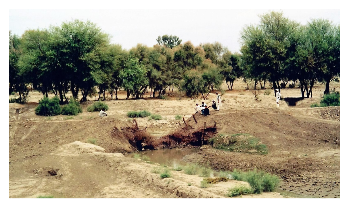
^ Fig. 5 Field-to-field irrigation in Pakistan (Source: Karim Nawaz, 2006).

can play an important role in food security and climate change adaptation. Spate irrigation has inbuilt disaster risk reduction and resilient approaches to disasters (floods) in ways that encourage sustainable human settlements (SDG 11). Spate flows need not be blocked in reservoirs: instead, they should be allowed to flow downstream to allow downstream users to benefit and to avoid the problem of siltation in reservoirs. Rather than storing flood water in reservoirs, we should make use of flood diversion strategies that have been practiced for centuries and that are based on the experience of farmers, in line with SDG 17.