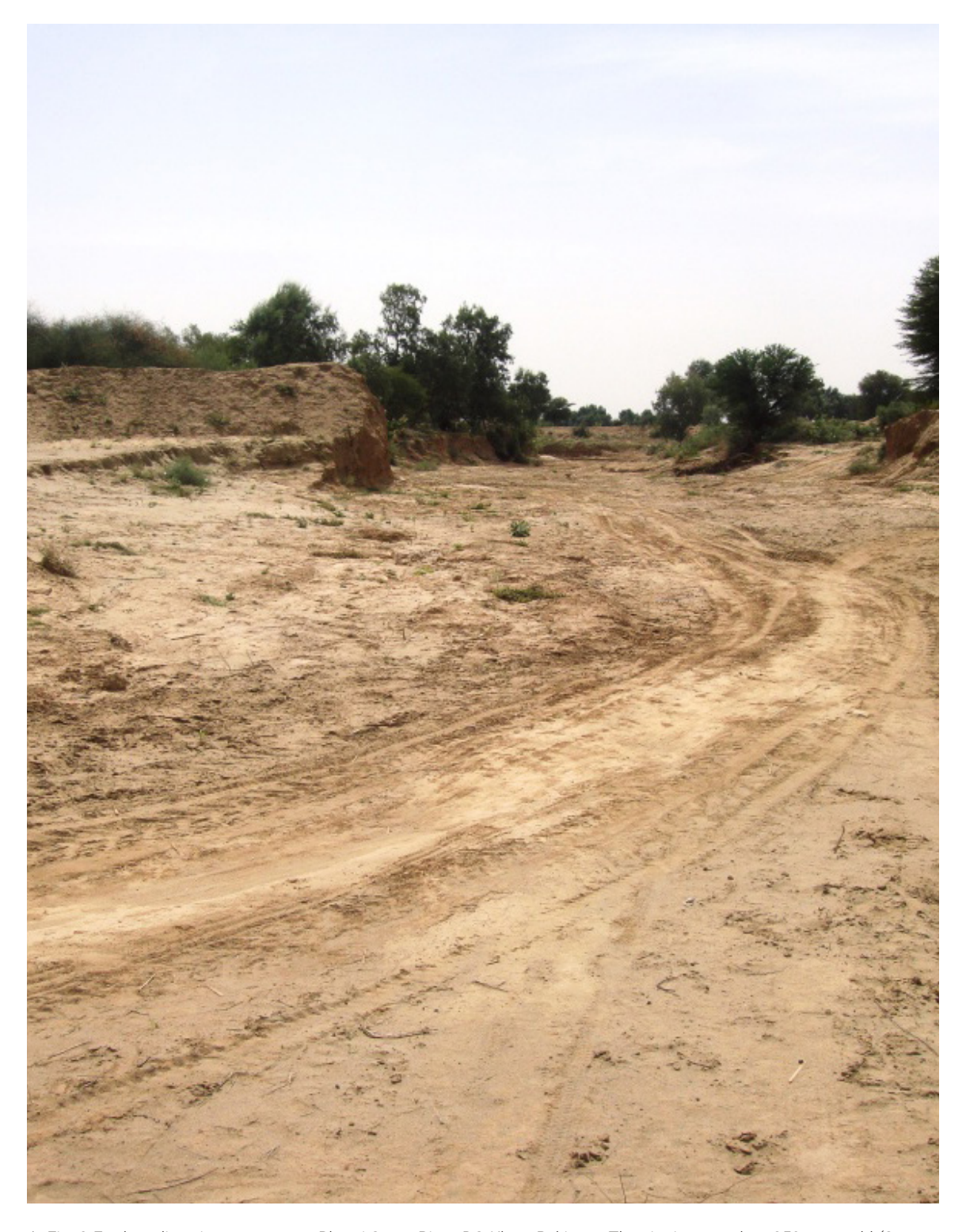
^ Fig. 3 Earthen diversion structure at Bhaati Spate River, DG Khan, Pakistan. The site is more than 250 years old (Source: Karim Nawaz, 2006).