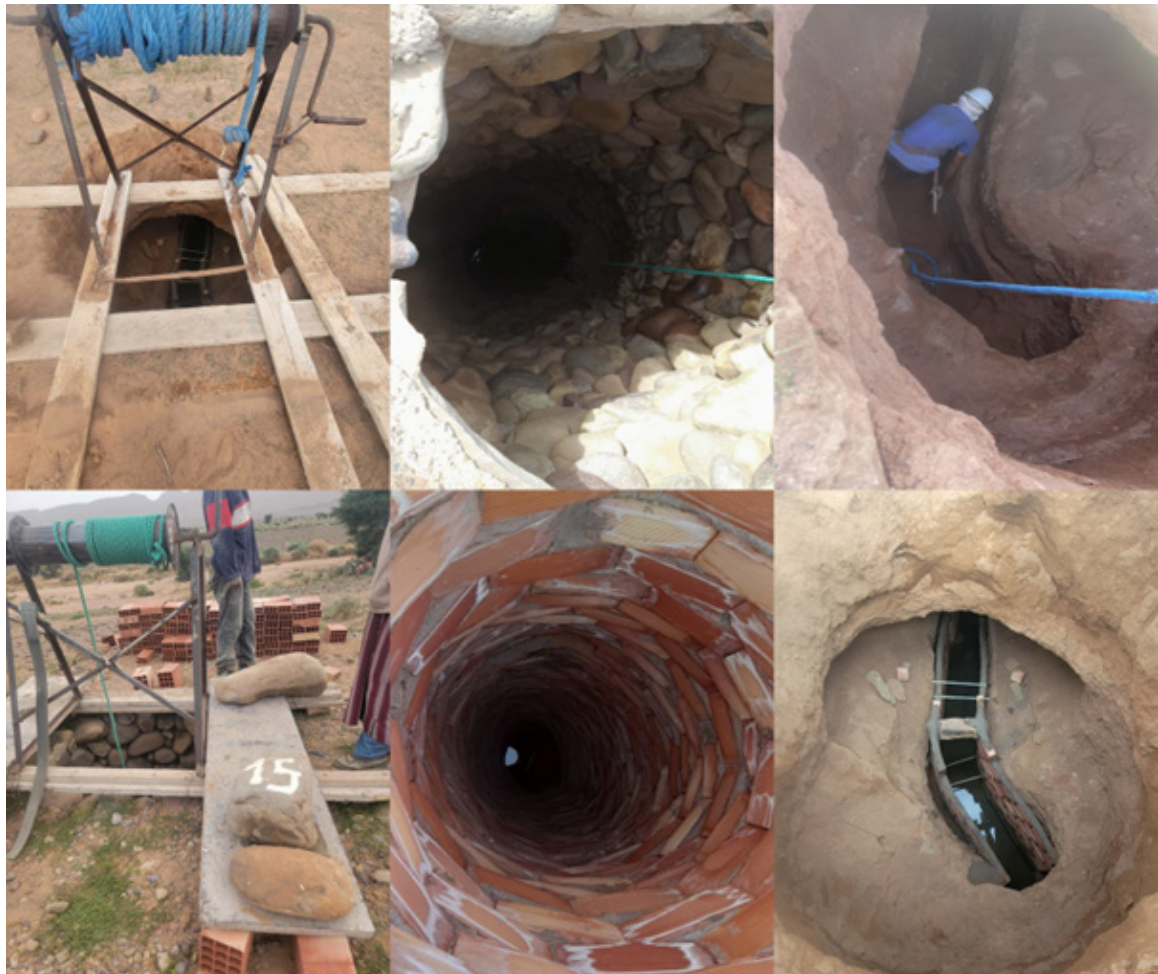
^ Fig. 4 Example of recent maintenance of a khattara near Ait Zeggane (Morocco) with modern techniques and materials. On the left you can see the systems for moving the material along the wells, in the center you can see two wells renovated with stone and bricks respectively, on the right you can see the maintenance work, during and after in a slightly kilned well (Source: Mhammad Houssni, 2024).

a timeless blueprint for the sustainable development of water systems worldwide (Barontini et al. 2018, 2017; Massoud 2022; Messous 2024; Taghavi-Jeloudar et al. 2013; Weingartner 2007).