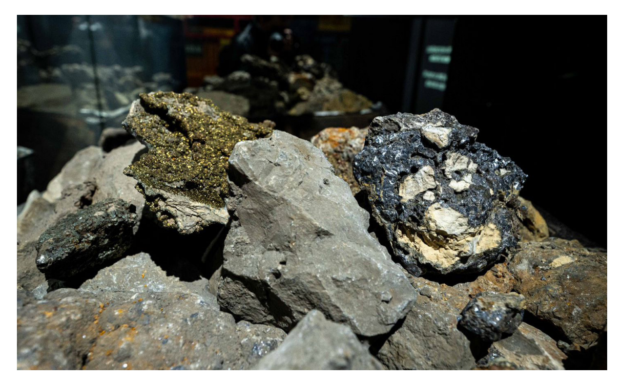
^ Fig. 2 Zinc and lead ore, Museum of Zink, Bukowno (Source: Daniel Sztork, 2022).