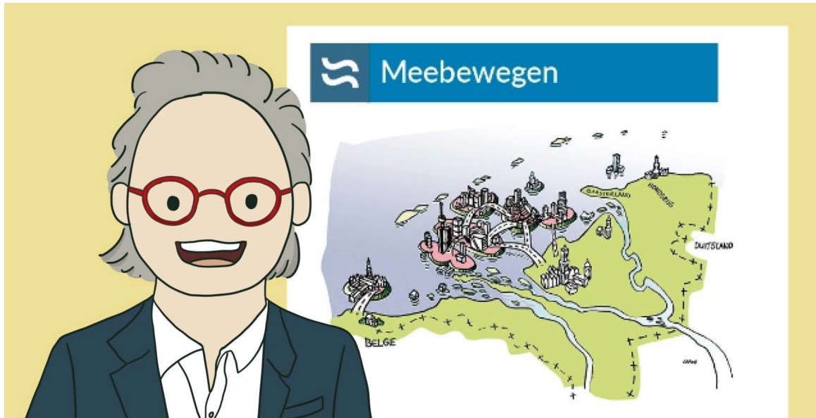
^ Fig. 4 Cartoon of the Delta Commissioner from 'How will the Netherlands defend itself against climate change?.

from Plan Ooievaar to the ministerial letter on WBS, we can now offer a summary: WBS is the current expression of meebewegen . As the virtual successor of Samen werken met water , WBS is tantamount to what we could call a “third Delta Commission report.” To say so signals its importance. WBS is on its way to becoming the law of the land . Although the idea of retreat is latent, measures that should be taken now if WBS were rigorously applied would facilitate or at least not hinder retreat when necessary. Retreat as a component of meebewegen is still on the table.