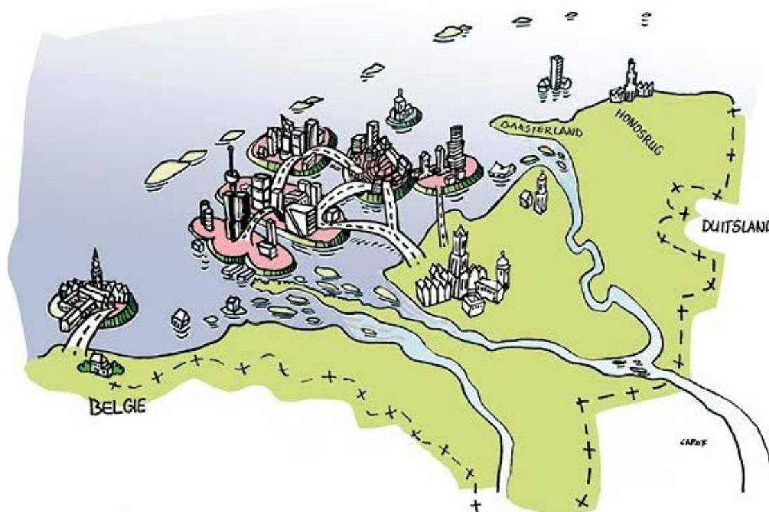
^ Fig. 3 The Meebewegen scenario.

principle of collaborating with nature: Samen werken met water (Working together with water). The report's chief insight is that "The best strategy for keeping the Netherlands safe and pleasantly habitable in the long run is to develop along with climate change. Moving with and making use of natural processes wherever possible leads to solutions to which man and nature can gradually adapt" (Deltacommissie 2008, 39). Repetitions and variations of the idea of collaborative adaptation proliferate: mee-groeien, mee stijgen, mee ontwikkelen, meegaan, and meebewegen (grow with, rise with, develop with, go with, move with).