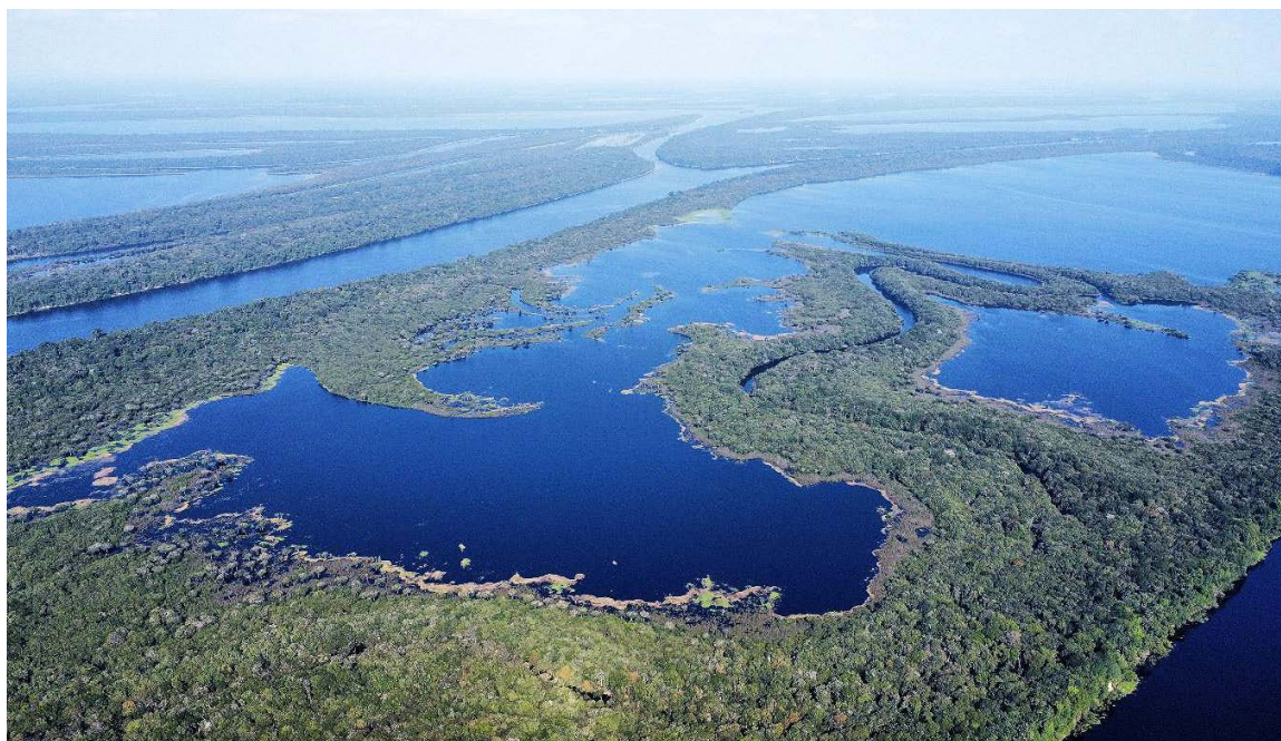
^ Fig. 3 The Brazilian Rio Negro and the Anavilhanas National Park (Source: Verônica Garcia Donoso, 2024).

protection of Brazil's material and non-material heritage, including that of the Amazon region. The protection effort in the Amazon region has been intensified since 2000 with the expansion of the legal framework for protected areas, taking into account the cultural elements of riparian and Indigenous communities (IPHAN 2007).