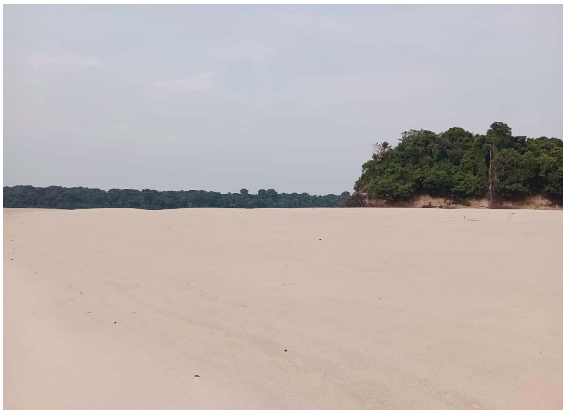
^ Fig. 4 Sand along the Rio Negro, exposed by extreme drought in the Anavilhanas region in October 2023.

climate change is well-established, there is a stronger emphasis on theory than on action in combating these issues. Deforestation is often driven by economic interests, resulting in a lack of long-term perspective in resource management. Addressing urgent environmental problems requires global and local action, institutional frameworks and technical capacity. A shared national and international vision is critical, particularly in the case of the Amazon region.